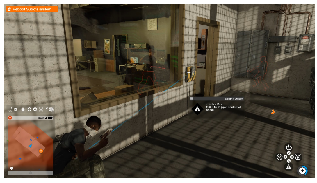
Figure 1: The player about to shock a guard by hacking an electrical panel.

The gameplay, through simulation, symbolizes both the joys and frustrations inherent to hacking. Most missions involve game players sneaking around a restricted area filled with guards who would shoot the player on sight. Players must use their hacking abilities and observation skills to evade the guards and to complete the objective. Players can use their smartphone to hack all kinds of things for different effects. They can make electric gauges and panels shock nearby guards or just cause a distraction (see Figure 1). They can use remote-controlled gadgets to scan for guards and even distract them with sounds. Watch Dogs 2 is as much a puzzle game as it is an action game. Not everything goes as planned, so the player must deal with those frustrations accordingly.